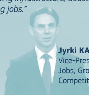
Jyrki KATAINEN Vice-President responsible for Jobs, Growth, Investment and Competitiveness

"Pan-European personal pension products will act to promote competition amongst pension providers, granting consumers more choice of where to place their savings. Completing the CMU is also an important element of the Investment Plan for Europe. I am pleased that this proposal will also work to channel savings towards long-term investments, helping to achieve the Investment Plan's objectives of upgrading infrastructure, boosting growth and supporting jobs."