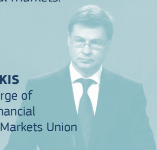
Valdis DOMBROVSKIS Vice-President in charge of Financial Stability, Financial Services and Capital Markets Union

"The pan-European personal pension product is an important milestone towards completing the Capital Markets Union. It has enormous potential as it will offer savers across the EU more choice when putting money aside for retirement. It will drive competition by allowing more providers to offer this product outside their national markets. It will work like a quality label and I am confident that the PEPP will also foster long-term investment in capital markets."