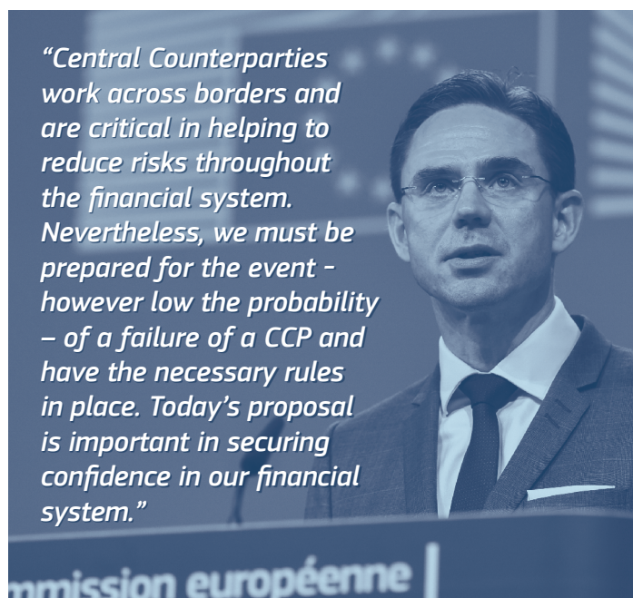
Valdis Dombrovskis Commission Vice-President in charge of Financial Stability, Financial Services and Capital Markets Union

"Central Counterparties work across borders and are critical in helping to reduce risks throughout the financial system. Nevertheless, we must be prepared for the event - however low the probability - of a failure of a CCP and have the necessary rules in place. Today's proposal is important in securing confidence in our financial system."