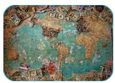
AML, CTF, Sanctions